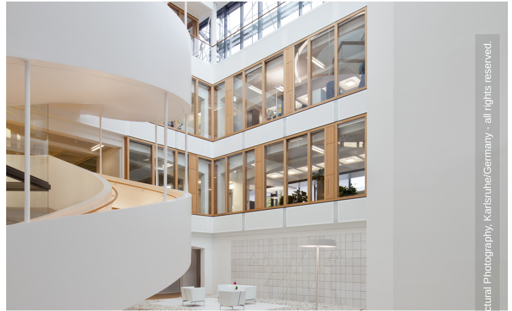
er. Architectural Photography, Karlsruhe/Germany - all rights reserved.