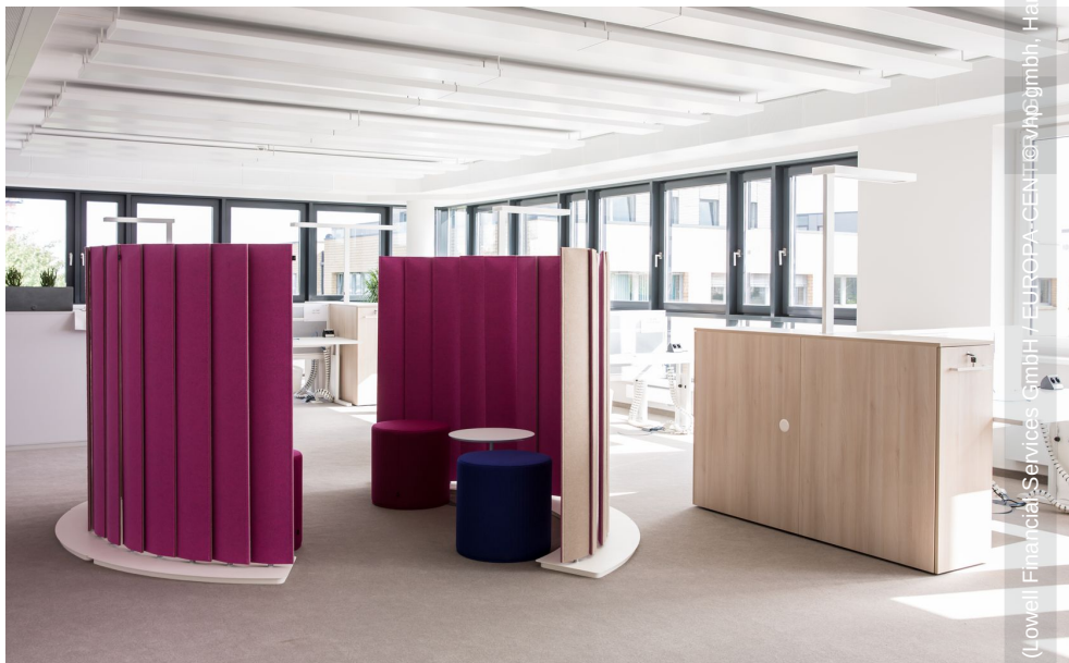
Hamburg (Lowell Financial Services GmbH / EUROPA-CENTERAG)