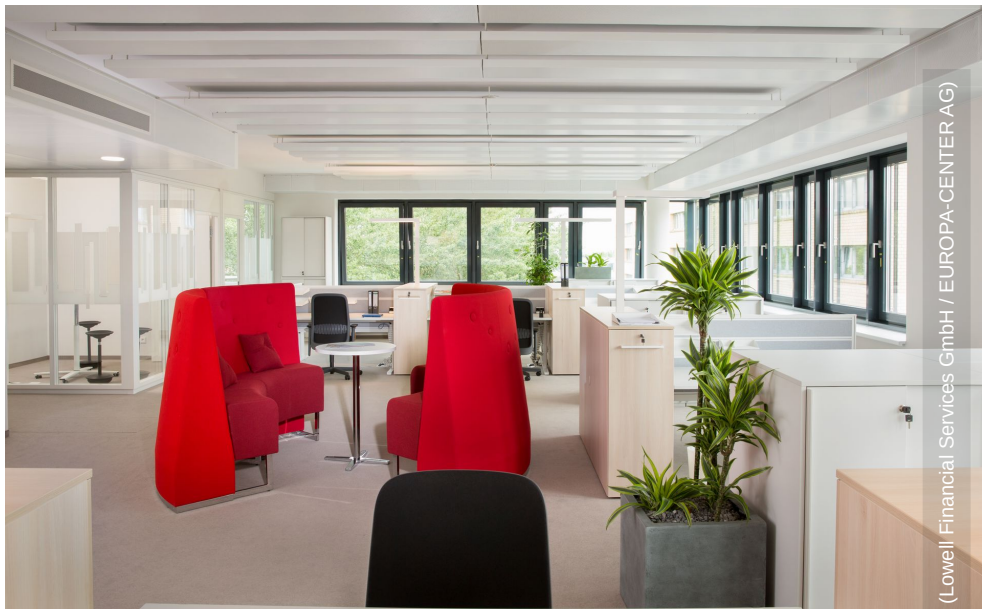
Hamburg