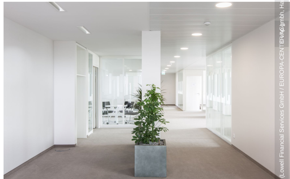
Hamburg (Lowell Financial Services GmbH / EUROPA-CENTERAG)