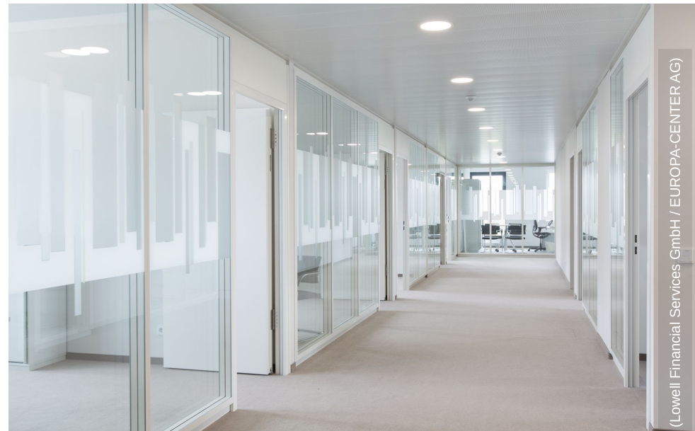
Hamburg