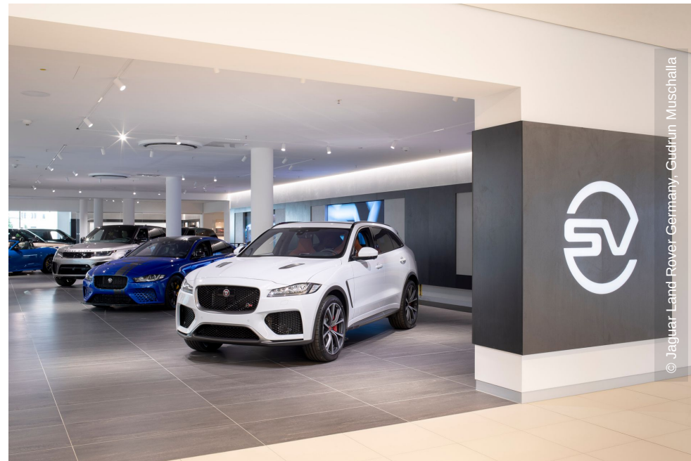
© Jaguar Land Rover Germany, Gudrun Muschalla