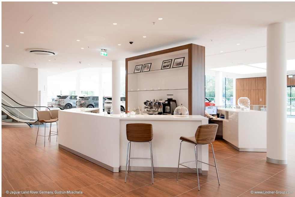
© Jaguar Land Rover Germany, Gudrun Muschalla