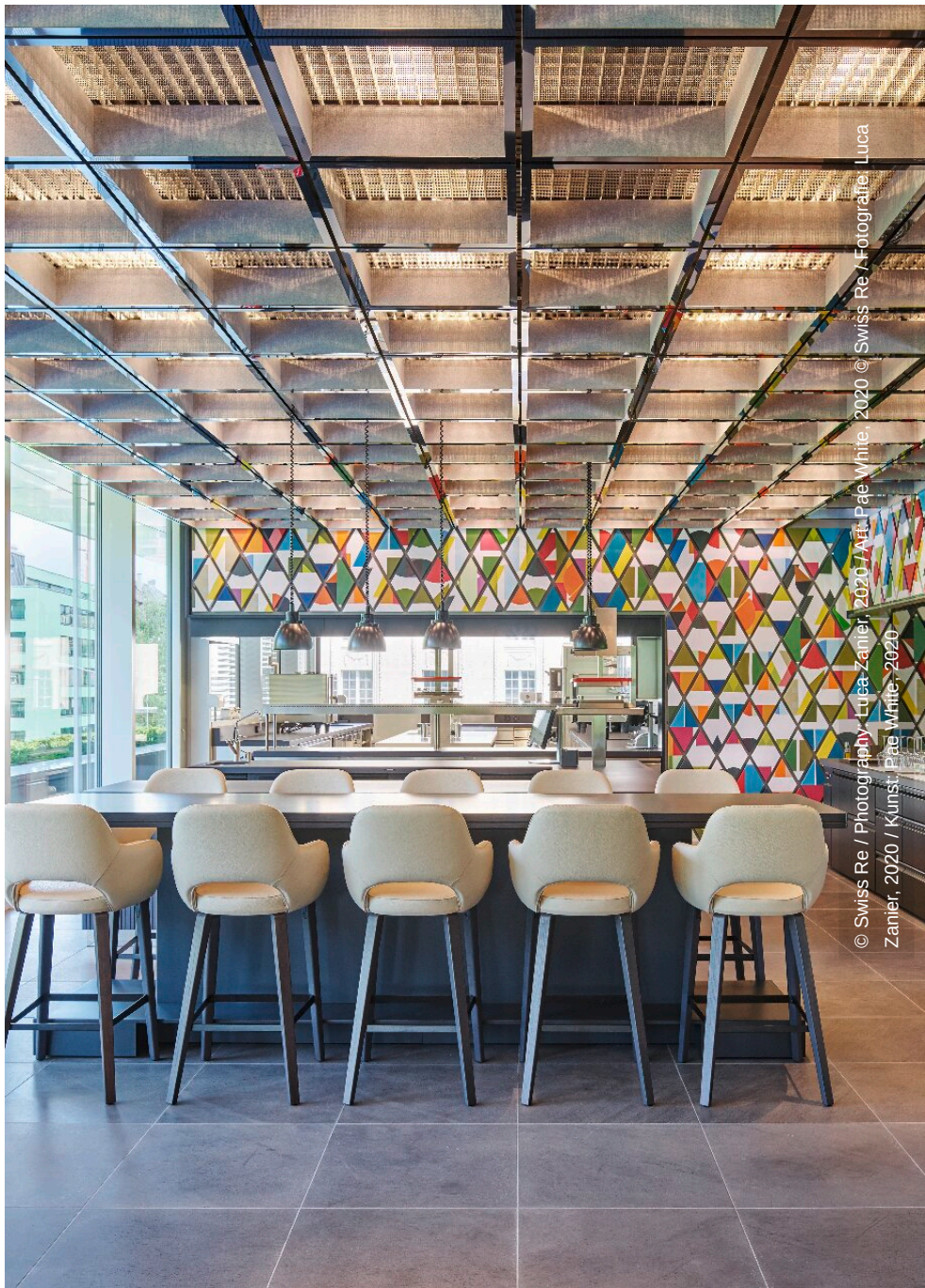
Art: Pae White, 2020 Kunst: Pae White, 2020