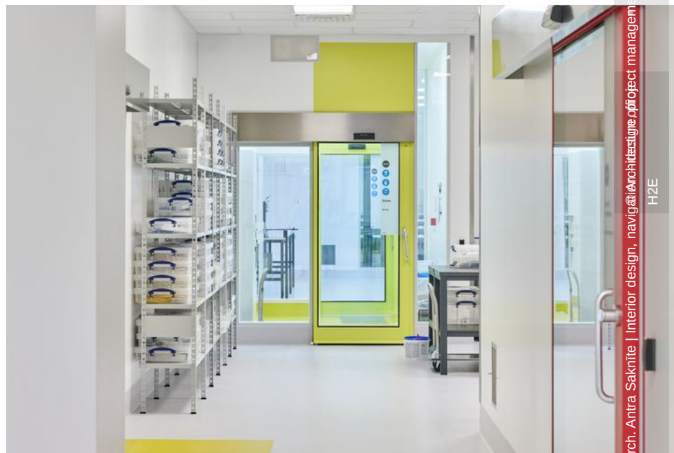
arch. Antra Saknīte | Interior design, navigation – design office