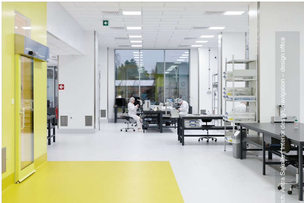
arch. Antra Saknīte | Interior design, navigation – design office