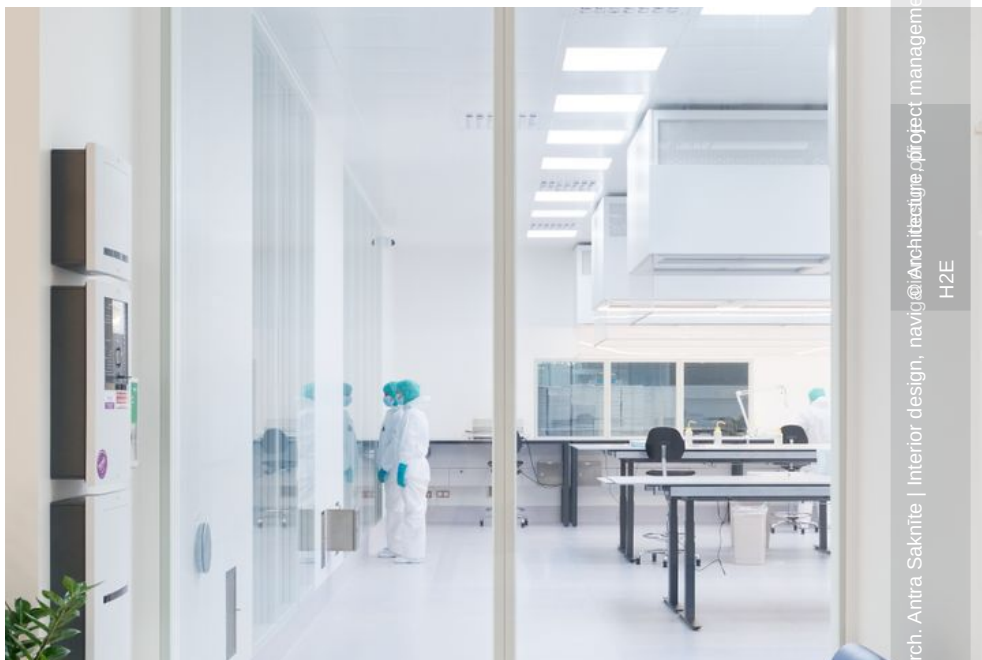
arch. Antra Saknīte | Interior design, navigation – design office