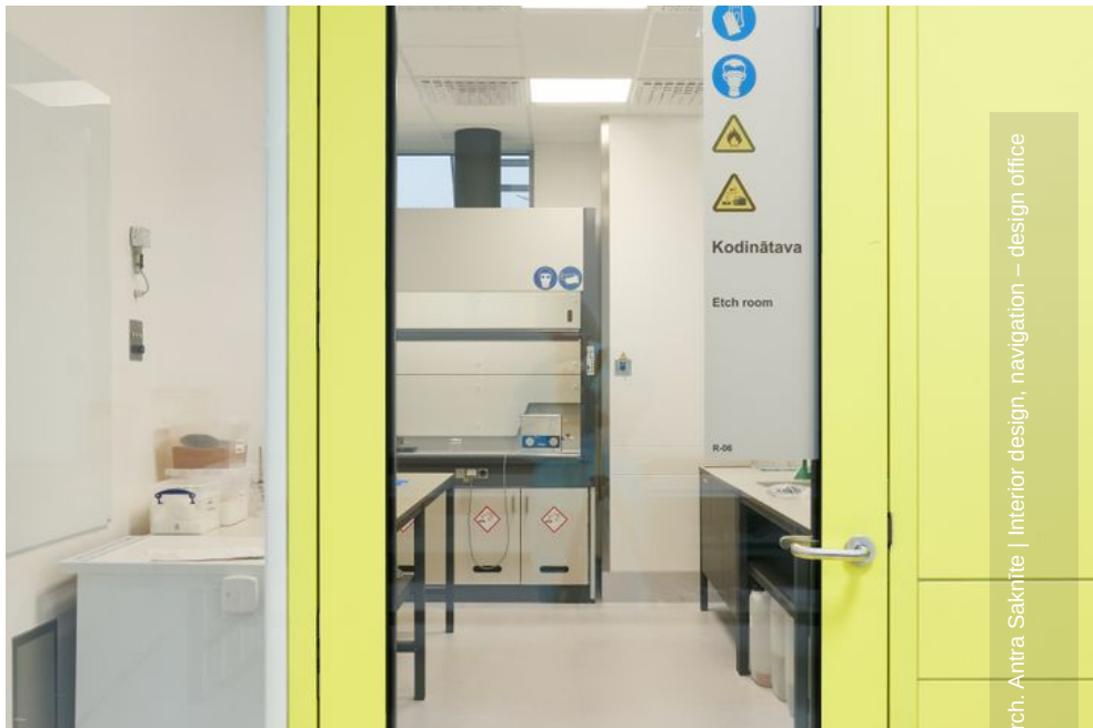
arch. Antra Saknīte | Interior design, navigation – design office