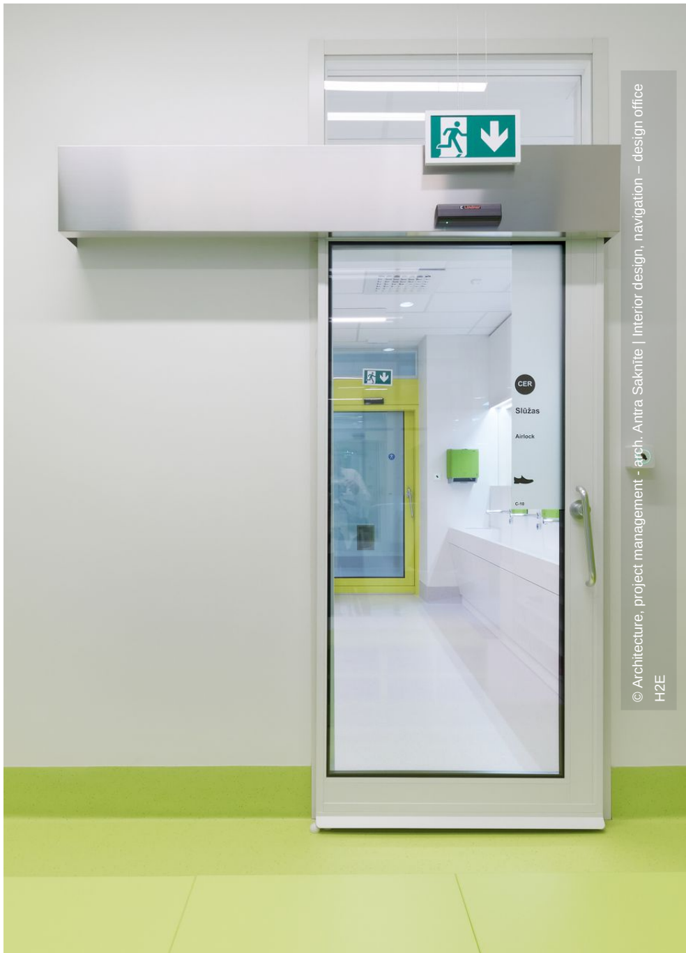
© Architecture, project management - arch. Antra Saknīte | Interior design, navigation – design office H2E